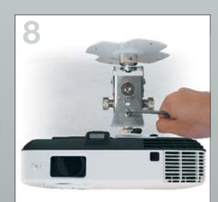
Once calibrated, lock the 4 button screws ensuring that they are firmly fixed in order not to have any vibration or play.