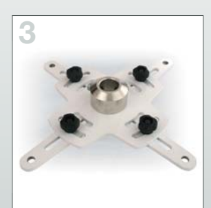
Position the inferior plate with adjustable arms on the bottom side of the videoprojector.