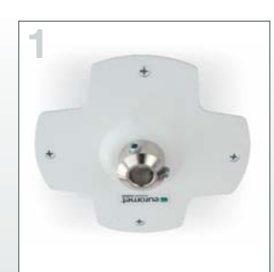
Position and securely fix the ceiling plate.