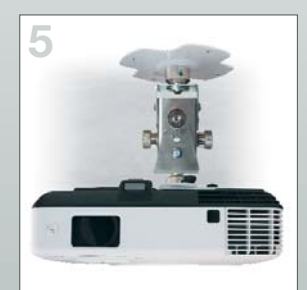
Fix the projector to the lower pivot of arakno and lock it in utilizing the kit's hexagonal wrench.