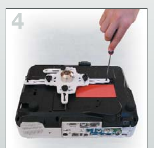
Fix the adjustable arm plate to the projector by positioning the plate's screws in correspondence to the designated holes on the bottom of the projector.