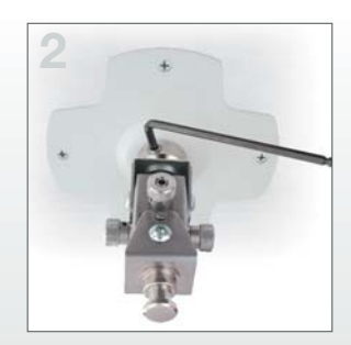
Insert the calibration device 'arakno' into the ceiling plate and lock it into place with the two screws utilizing the hexagonal wrench.