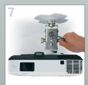
Possibility (in the case of heavy loads) to finely calibrate the projector's position with the aid of the hexagonal wrench.