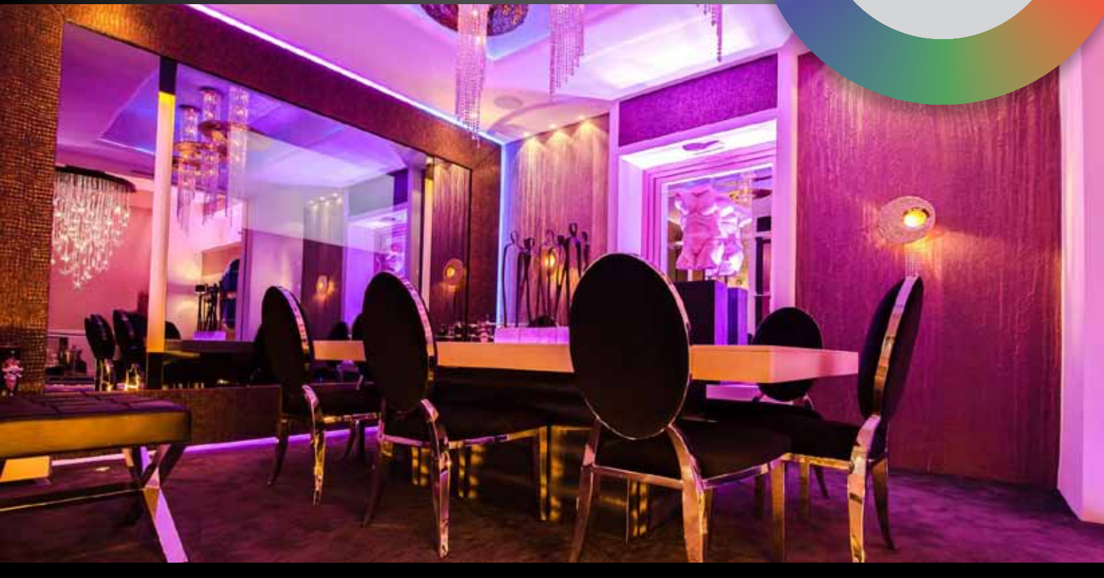
The digital, multi-room lighting control system from Sun-Light Solutions Ltd.